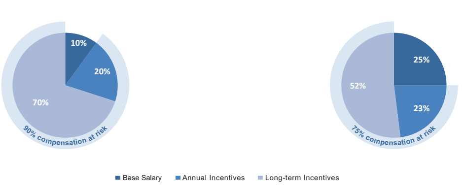
2016 Chairman & CEO Target Compensation Mix